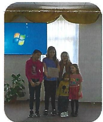
Our girls and friends singing a special for Thanksgiving services at Feldioara