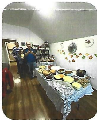
We enjoyed a tasty Thanksgiving feast with friends!