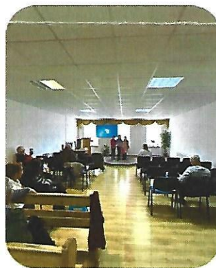
Special Thanksgiving service at Feldioara.