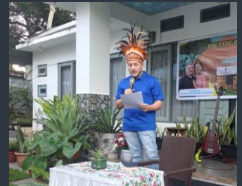
Sharing at the Youth Event

Thank you for your prayers and thank you to all our financial partners.