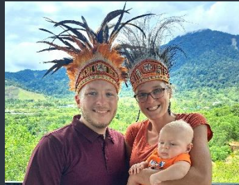
Sporting our Special Papuan Hats from the Youth

Taking God's word to those who haven't heard